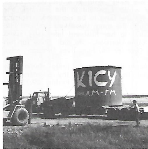
10,000 gallon fuel tank at transmitter site for 50 KW generator. One fill must last at least six months because of closed roads.